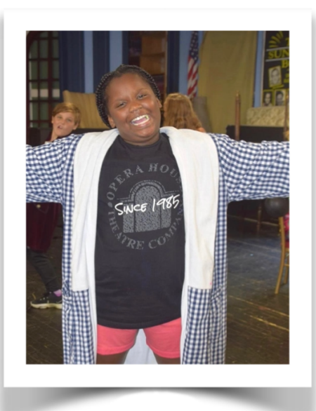
Thank-You Youth Scholarship Supporters!